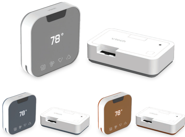
E-Smart W960 Thermostat

The new E-Smart W960 is an advanced wireless thermostat that provides guestroom comfort while reducing HVAC energy costs. The W960 wireless thermostat allows for convenient guest room temperature control and enables you to easily relocate the thermostat location without the need for additional wiring. The elegant design incorporates Wi-Fi to enable remote management from a smartphone application and has the ability to integrate with networked energy and property management systems. Up to 3 additional W960 accessory wireless thermostats can be networked to allow multi-point control of a single HVAC system without the need for additional wiring. Installation is a breeze with the included E-Smart configuration tool. The W960 is constructed of antibacterial materials which help to reduce the risk of spreading infection.