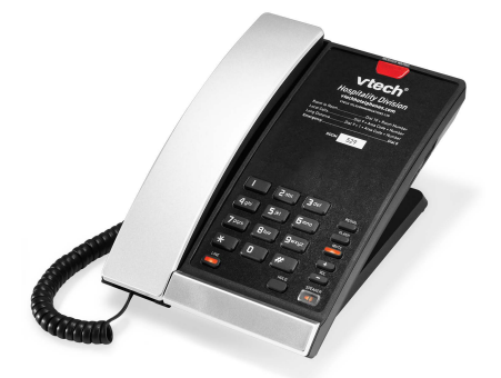
S2210-X (1-Line) 0 Speed Dials Silver/Black