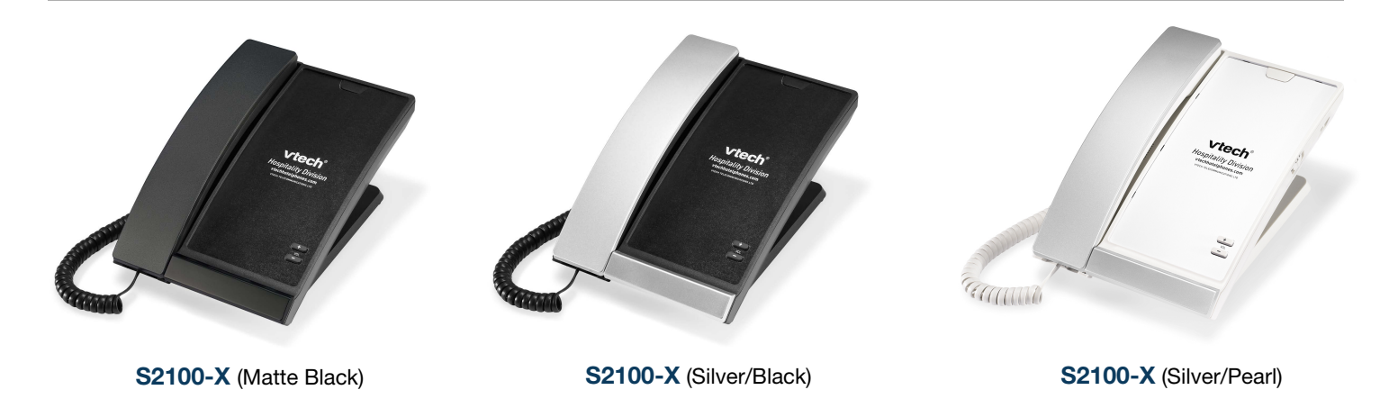
1-Line SIP Contemporary Corded Lobby Hotel Telephone