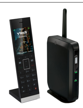
CTM-A2116 (Silver & Black)

1-Line Analog Cordless Color Accessory Handset with Charger