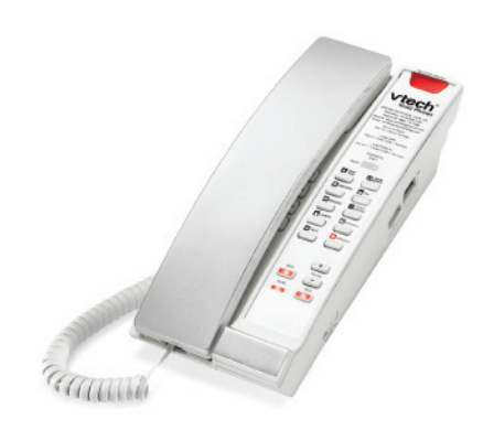
Silver and Pearl

Phone Measurements: 3.6 in. x 8.5 in. x 2.4 in., 1.5 lbs