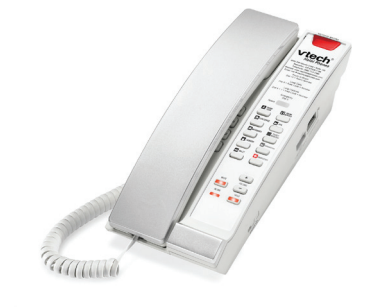
Silver and Pearl