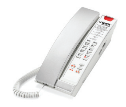
Silver and Pearl