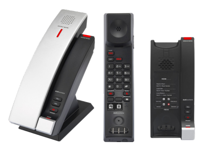
CTM-S2415 (Silver & Black) 1-Line Contemporary SIP Cordless Phone

CTM-S2415W (Matte Black Only) 1-Line Contemporary SIP Wi-Fi Cordless Phone