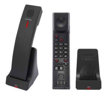
CTM-S2415HC (Matte Black) CTM-C4402+C4012 Contemporary SIP 1-Line Cordless Accessory Handset and Charger