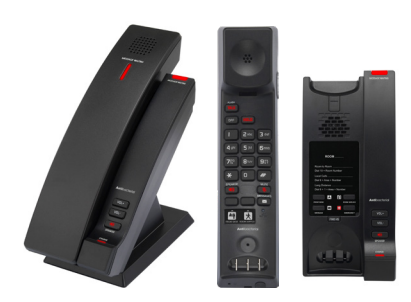
CTM-S2415 (Matte Black) 1-Line Contemporary SIP Cordless Phone

CTM-S2415W (Matte Black Only) 1-Line Contemporary SIP Wi-Fi Cordless Phone