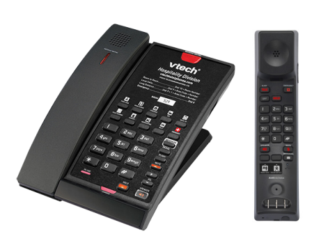
CTM-S2412 (Matte Black) 1-Line Contemporary SIP Cordless Phone