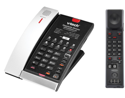
CTM-S2412 (Silver & Black) 1-Line Contemporary SIP Cordless Phone