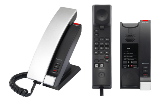
CTM-S2315 (Silver & Black) 1-Line Contemporary SIP Corded Phone

CTM-S2315W (Matte Black Only) 1-Line Contemporary SIP WiFi Corded Phone