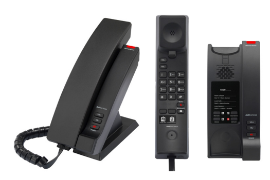
CTM-S2315 (Matte Black) 1-Line Contemporary SIP Corded Phone

CTM-S2315W (Matte Black Only) 1-Line Contemporary SIP WiFi Corded Phone