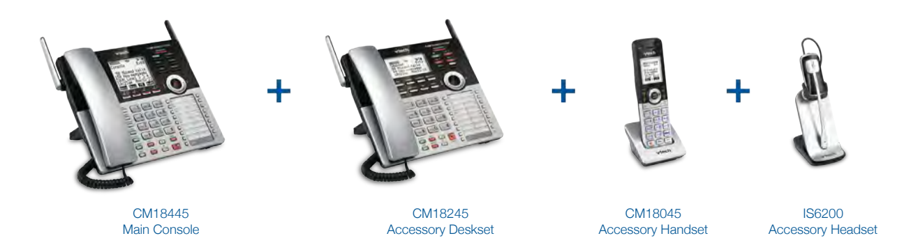
VTech 4-Line Small Business System

Adding more phones and accessories is easy. For example, if and when Craftwork needs to add a deskset for a new employee, they follow one simple step—plug the wireless deskset into an AC power outlet. That's it. The desket will automatically register to the network. "You could have not done that with our old system," Grubb says.