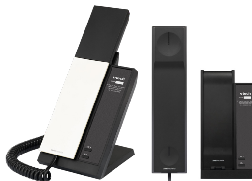
NG-A3100 1-Line Analog Lobby Corded Phone