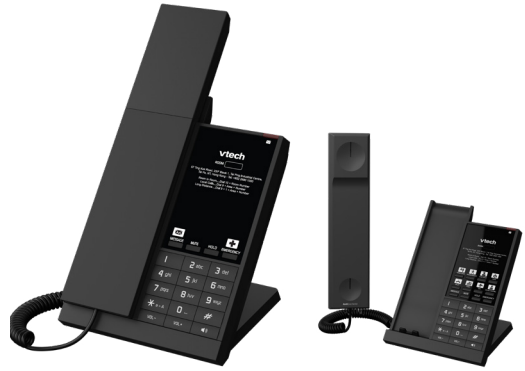
NG-S3211 | NG-S3211W (with WiFi) 1-Line SIP Corded Phone