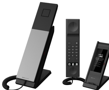
NG-A3311 1-Line Analog Corded Phone