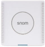
M900 DECT Multi-cell Base Station

Our powerful multi-cell DECT solutions offer range and flexibility that cover multiple floors and buildings