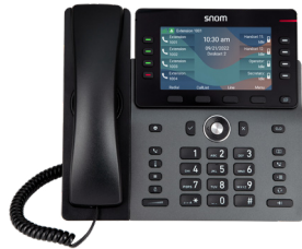
M58 DECT Desk Phone