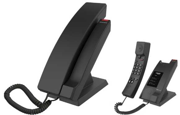
CTM-S2315 | CTM-S2315W (with WiFi) 1-Line SIP Corded Phone