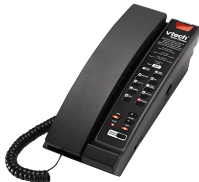
A2211 Contemporary Analog Corded Petite Phone