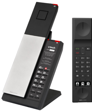
NG-S3412 1-Line SIP Cordless Phone

VTech has the most sophisticated and secure SIP stack in the industry