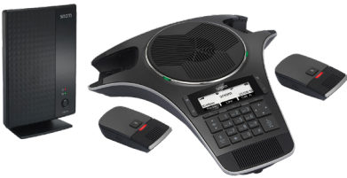
C620 SIP Wireless Conference Phone

Our family of conference phones meets your needs whether in your huddle room, conference room, board room, or training room