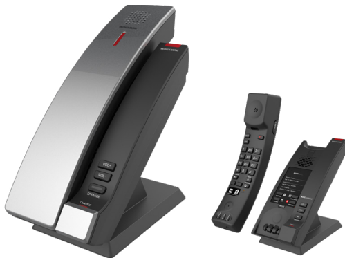
CTM-S2415 | CTM-S2415W (with WiFi) 1-Line SIP Cordless Phone