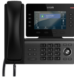
D812 Desk Phone