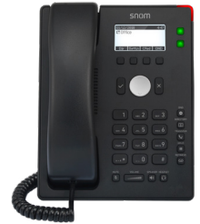
D120 Desk Phone