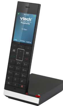
NG-S3111 1-Line SIP Cordless Phone