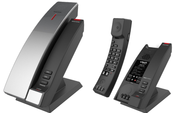
CTM-A2415 1-Line Analog Cordless Phone