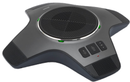
C52-SP DECT Expansion Speakerphone