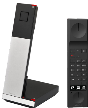
NG-A3112 1-Line Analog Cordless Phone