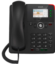
D717 Desk Phone