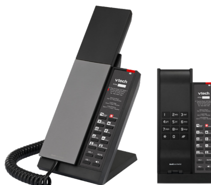
NG-A3212 1-Line Analog Corded Phone