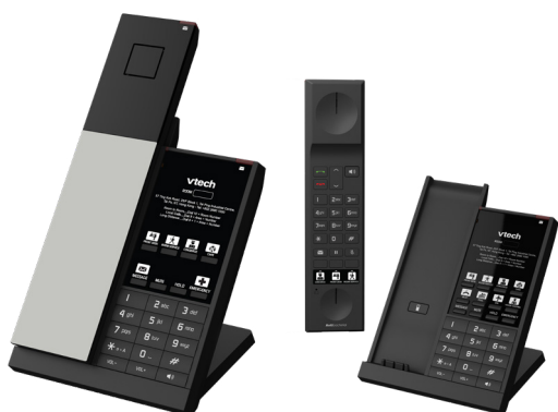
NG-A3411 1-Line Analog Cordless Phone with Battery Backup