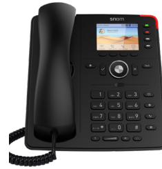
D713 Desk Phone