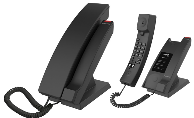
CTM-A2315 1-Line Analog Corded Phone