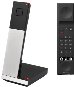
NG-S3112 1-Line SIP Cordless Phone