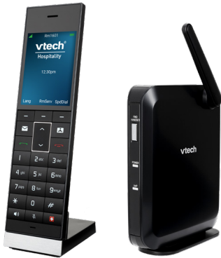
CTM-S2116 1-Line SIP Hidden Base w/1 Cordless Color Handset & Charger