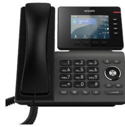
D810 Desk Phone D810WB Desk Phone