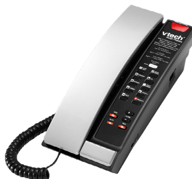
A2211-SPK Contemporary Analog Corded Petite Phone with Speakerphone