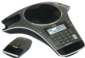
VCS702 ErisStation Conference Phone w/2 Wireless Mics