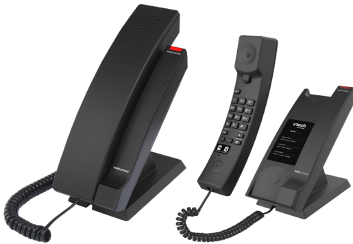
CTM-A2315-SPK 1-Line Analog Corded Phone