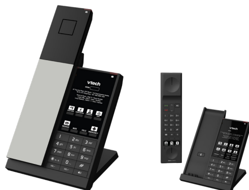
NG-S3411 | NG-S3411W (with WiFi) 1-Line SIP Cordless Phone