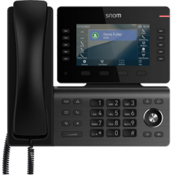
D815W Desk Phone D815WB Desk Phone

Only Snom and VTech can outfit your entire property's communication needs in the guest room, back-end operations, restaurant, and conference spaces.