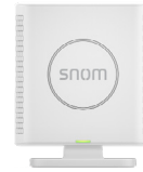
M6 DECT Repeater