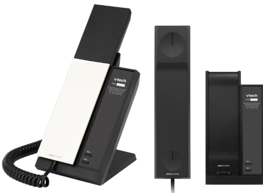
NG-S3100 1-Line SIP Lobby Corded Phone