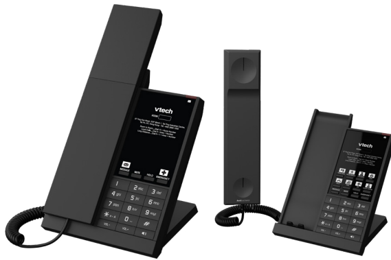
NG-A3211 1-Line Analog Corded Phone