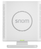
M400 DECT Single-cell Base Station