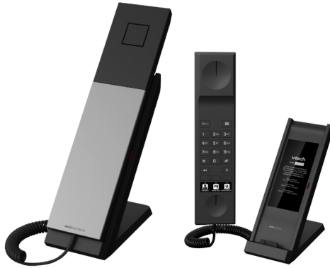
NG-S3311 1-Line SIP Corded Phone