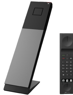
NG-C3411HC 1-Line Cordless Accessory Handset and Charger