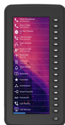
D7C Expansion Module