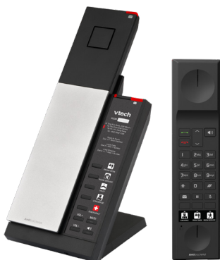
NG-A3412 1-Line Analog Cordless Phone with Battery Backup

VTech analog cordless room phones are Energy Star® certified, providing energy and cost savings