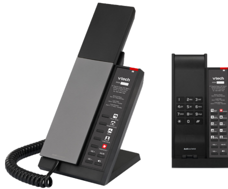
NG-S3212 1-Line SIP Corded Phone