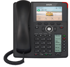
D785 Desk Phone