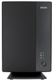
M500 DECT Base Station

The cordless base station and handsets offer flexibility and mobility throughout the property