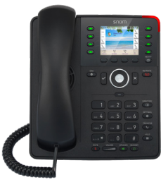
D735 Desk Phone