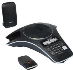
VCS712 ErisStation Conference Phone w/2 Wireless Mics