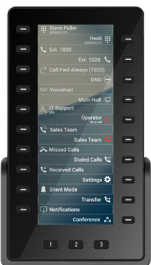
D8C Expansion Module